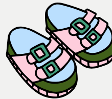
sandals, including tevas, chacos, & birkenstocks