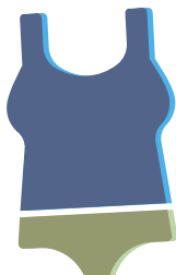
Tankinis & rash guards