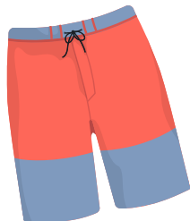
comfortable-length swim or board shorts