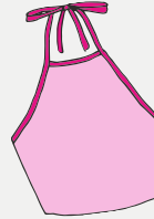
spaghetti strap shirts