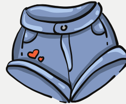
Shorts that ride too high or too low