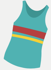
Sleeveless shirts or tank tops