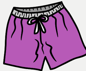
swim shorts that are too short or tight